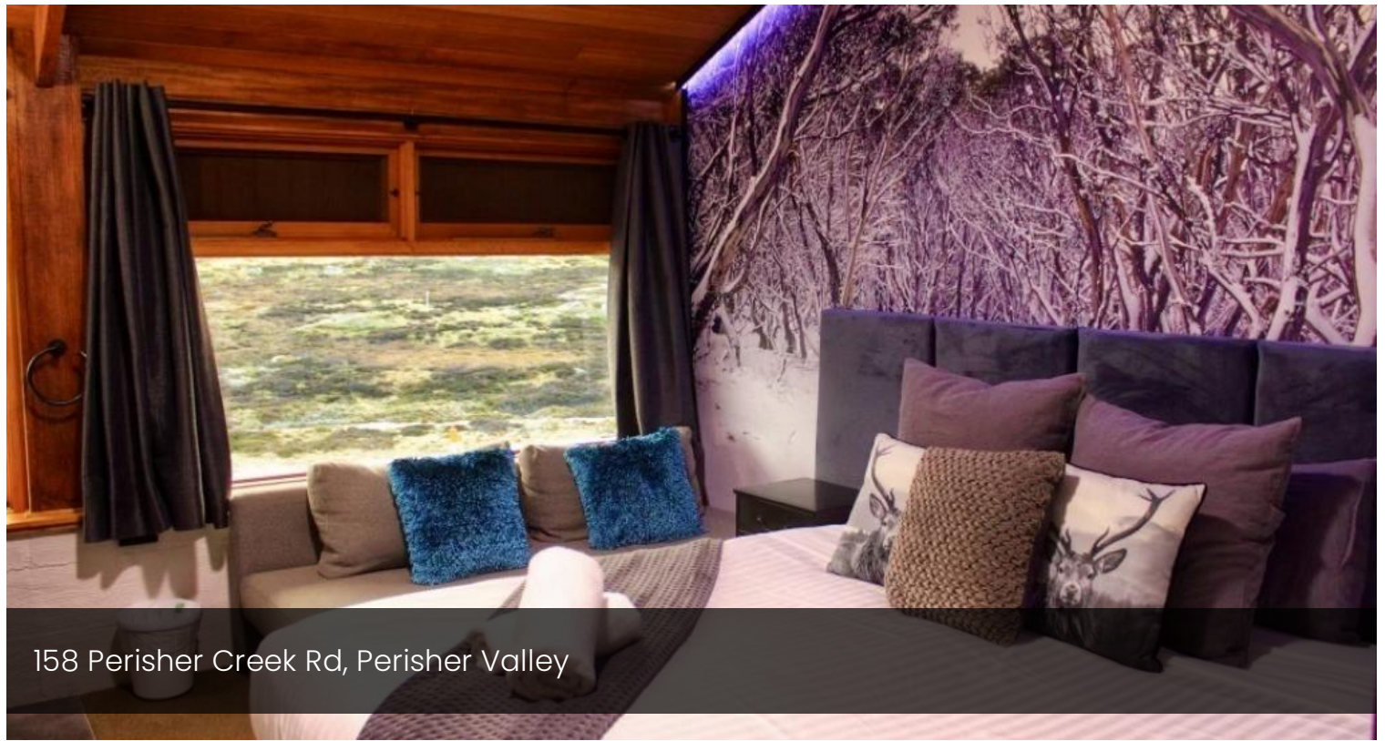
158 Perisher Creek Rd, Perisher Valley